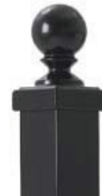
Ball Cap shown on post