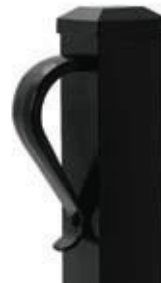
Lamb's Tongue shown on post