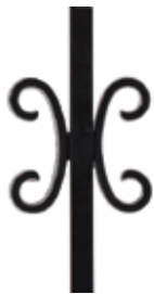
Butterfly Scroll shown on spindle