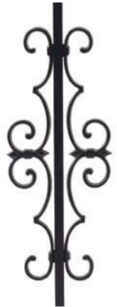
Estate Scroll shown on spindle