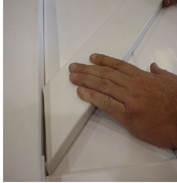
11 Insert between bottom and top or 2 nd rail, depending on style.