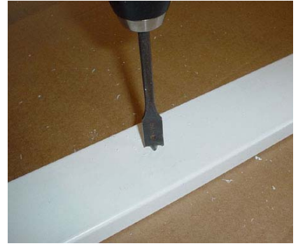
13 Remove Brace and drill 3 evenly spaced 5/16" holes in one side only!