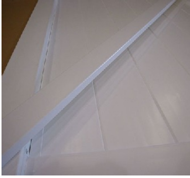
10 Lay out ½" x 3" brace and mark to cut on a 45 degree angle.