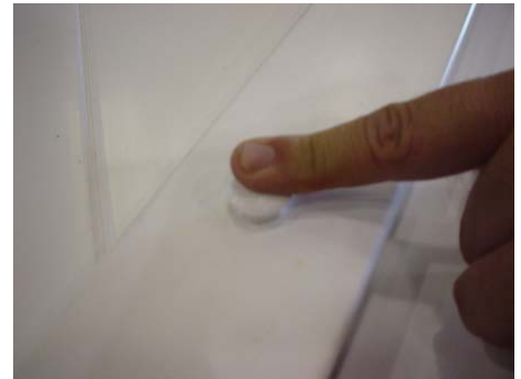
15 Insert button cap to cover screw hole.

Note: For added strength, brace can be attached with PVC glue before being screwed